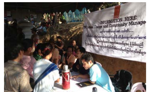
TBC Staff and Camp-based teams serve as ration counsellors during ration distribution in Mae La Camp.