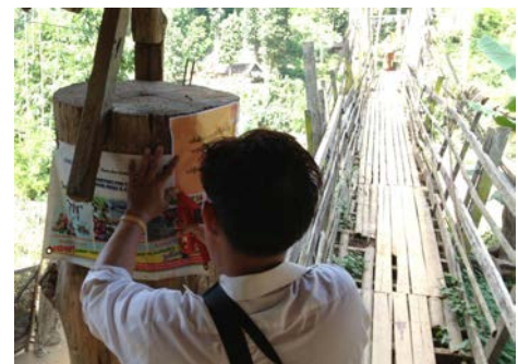
The Campaign Manager for TBC's Ration Changes Communications Campaign in Mae La Ma Luang posts information about upcoming changes at the entrance to a bridge over the Mae Sariang River.

TBC is continuing to work with the camp communities to refine the CMT criteria, evaluate appeals, and respond to community feedback and concerns in the coming months.